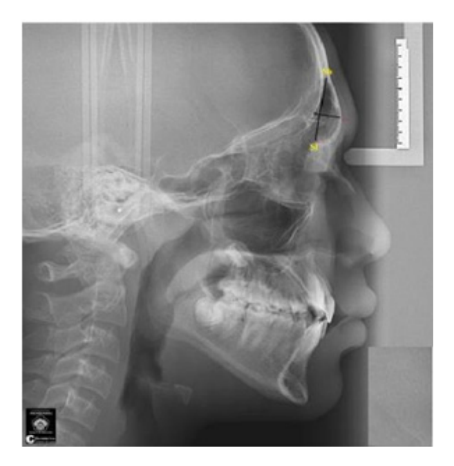
Figure 1. Measurement of the frontal sinus anteroposterior the method according to Erturk<sup>3</sup>

The exclusion criteria of sample is radiographs were taken from December 2009 until November 2014 which has been destroyed. The inclusion criteria for the sample were radiographs